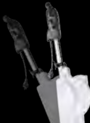
FM33/43 G - FM43 DS

FM43 DS is a dual speed belt driven single disc machine, cable powered, with large tank capacity and 43 cm working width. It is extremely low-noise and suitable for: scrubbing, maintenance cleaning and polishing synthetic, vinyl and carpet floors.