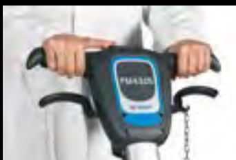
FM33/43 G - FM43 DS

They are equipped with a safety system through which the machine activation depends on the simultaneous pressure of the handlebars levers and dead's man button. When the levers are released the machine stops